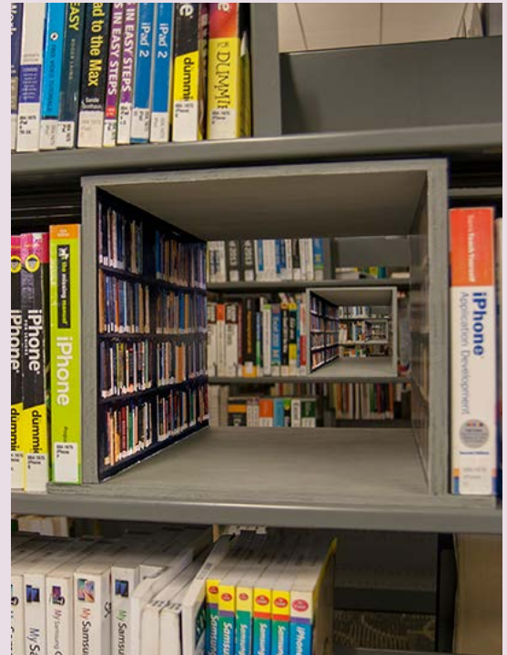
exhibit highlights the library as an institution that uniquely produces and shares knowledge and inquiry. The Jackson Heights-based artist focuses on how social and in-person exchanges of knowledge take place in the library's physical space, even in an age when the Internet has replaced much of the research that used to take place in libraries. This exhibit creates viewing portals within stacks of books, inviting library visitors to uncover and connect the library's different knowledge systems.